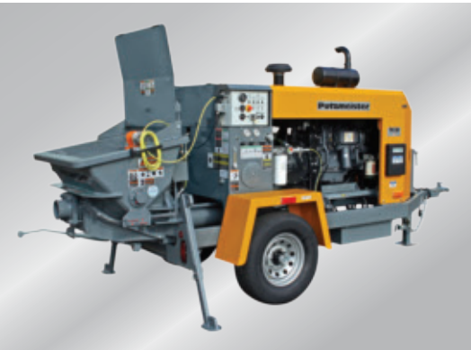
Thom-Katt Series — Tier 3