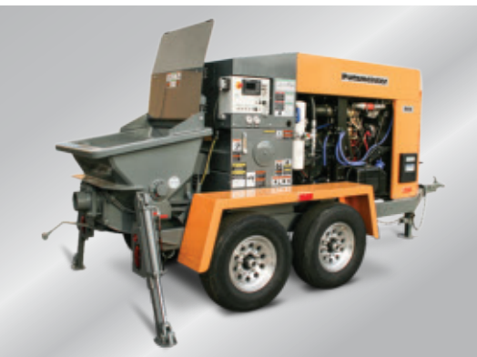
Thom-Katt Series — Tier 4 Final